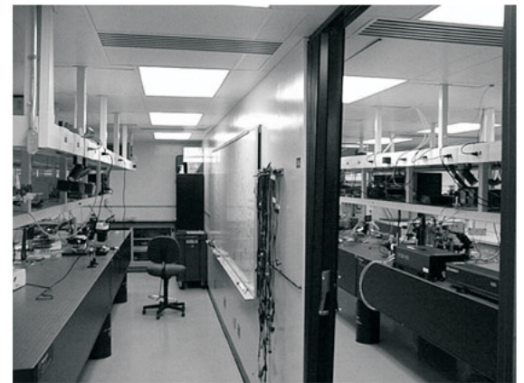
A class 10,000 clean room at the Photonics Systems group.

Sponsorship provides the resources for organizing and maintaining our seasonal series of lectures on the research being done at McGill. These lectures allow students to explore the types of departmental research and experiments conducted in our labs, as well as obtain genuine academic counseling for those interested in pursuing graduate studies.