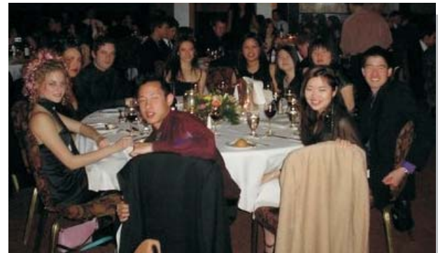
ExCESS Banquet, 2004

Corporate sponsorship helps support our activities and services. Part of that funding is also used to buy academic equipment for students. It is due to this involvement that ExCESS has a strong campus presence.